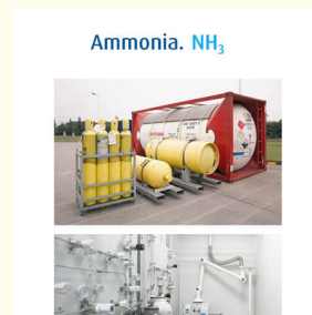
Ammonia. NH 3