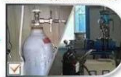
3. Vacuum & Drying 12 hours