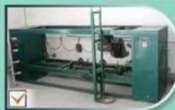
Inner Rust & Polish