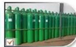
1. Cylinder Surface Inspection & treatment