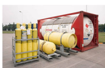
Ammonia. NH 3